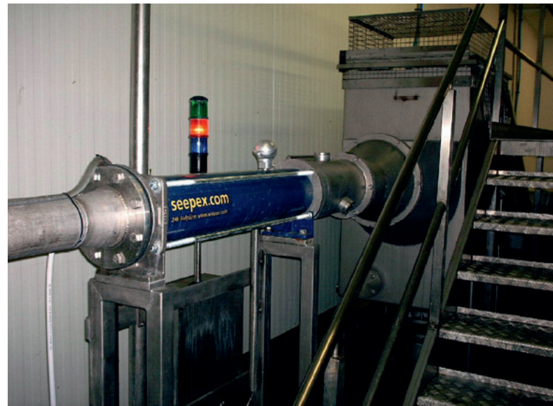
seepex BTM pump with integral stone trap and cutting knives handles waste vegetables, replacing both widethroat pump with grinder and the screw conveyor

Starting with a blank canvas the seepex project team analysed the waste removal operation and put together a turnkey package for the customer. This package involved design, supply, installation and commissioning of a full waste transfer and dewatering system.