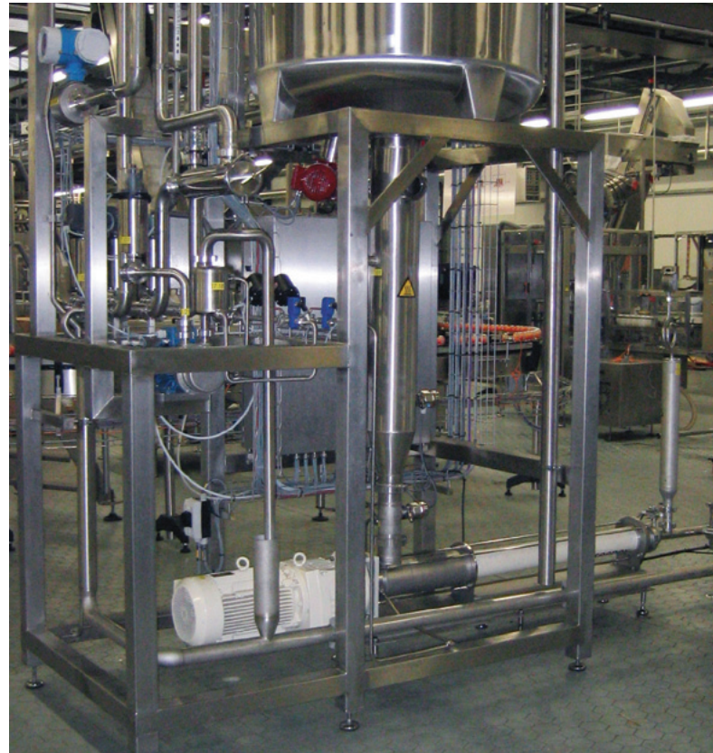
seepex pump range BCSB below the degassing facility

Several successful test series, during which the pumps were tested using the original product, resulted in the delivery of the pumps by seepex. The special construction of the two conveyor elements, rotor and stator, ensures the non-destructive delivery of the products before and after the conveyance process.