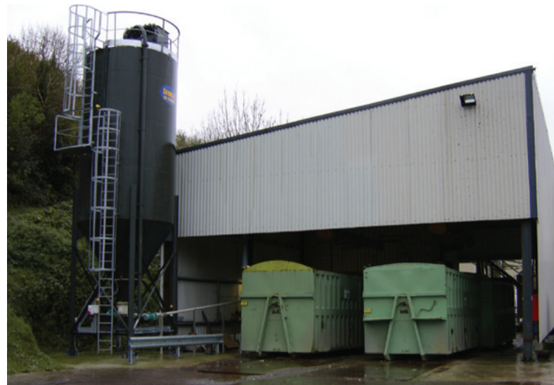
Lime silo and condition sludge container storage

seepex's engineers devised a tailored solution to transport between two and six tonnes per hour of 15-18 % dry solid dewatered sludge and dosing it with up to 40 % quicklime. This customised solution incorporates a pump fitted with an integral bridge breaker/mixing device, and lime metering system to control the dosing of quick lime. The purpose designed control system allows integrated measurement of sludge level, pressure and temperature as well as efficient lime dosage in order to achieve the pathogen kill and pH rise. The enclosed discharge pipe work and automated valves enable the filling of four skips.