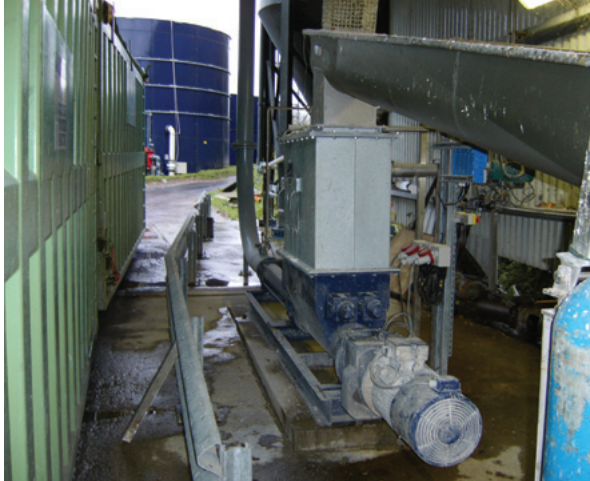
seepex BTI lime mixing pump