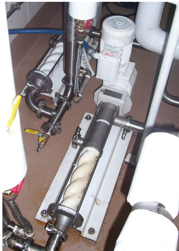
seepex BCSO pump range with equal wall stator for conveying nougat and caramel fillings