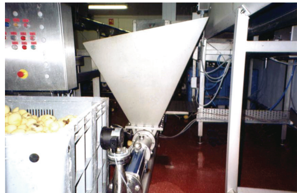
seepex BTM range pump with open hopper

The seepex solution was to install one of their BTM progressive cavity pumps, sized to match the maximum daily waste volume produced. The open hopper design of the pump allows the waste to be conveyed via the auger feed screw to the in-built cutters. Here the waste is chopped and macerated and then pumped to the final reception area for disposal.