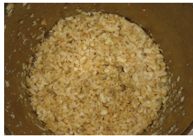
Potatoes before and after macerating and transportation