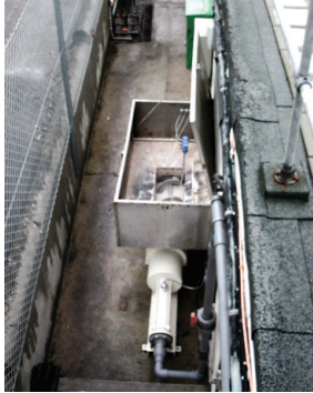
seepex BTH range pump mounted outdoors against the wall of the production area