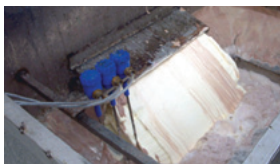
Waste frozen ice cream entering the pump hopper

To ease installation the seepex BTH pump was mounted outdoors against the wall of the production area with a large capacity extension hopper above it. A stainless chute passes through the wall allowing waste ice cream to be dumped into the pump from the production area. Level probes in the pump hopper ensures the pump runs only when there is waste to be removed. The waste is then pumped approximately 30 m into the holding tank.