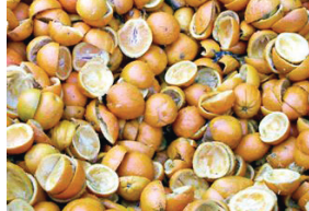
Orange peel before and after being handled with a seepex BTM range pump