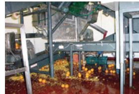
Existing installation with conveyors under juicing machine

Yet, this fruit processing plant is one of Britain's most successful manufacturers. When photographed, there was a great deal of mess and the whole process of handling fruit waste was causing a lot of headaches – and wasting a lot of money. Traditionally fruit waste from juicing machines has been transported to external collection points via conveyor systems, these are now proving to be redundant as a more cost effective and cleaner solution is available.