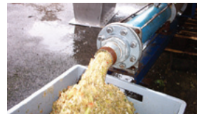
... and after chopping