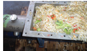
Bean sprouts before ...

However, disposing of surplus or reject bean sprouts (the humble mung bean) was creating a serious problem. The bean sprouts are grown from seed on site until they are ready for processing. The problem arose when, for whatever reason, there were surplus bean sprouts either before or after processing. As with so many vegetables, bean sprouts deteriorate rapidly within a few hours of harvesting and quickly become unfit for consumption, incurring handling, transport and high landfill costs in their disposal.