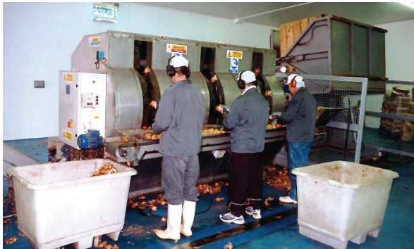
Onions being placed into peeling machine