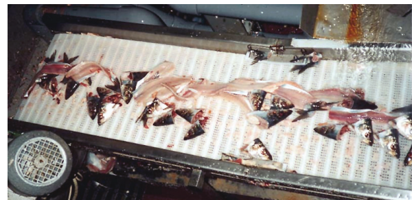
Heads, tails and frames from filleting machines

Both the belt conveyor and the BN pumps discharge into a seepex BT open hopper pump at the end of each row of filleting machines. These pumps in turn pump the waste fish products directly into a container for processing into fishmeal.