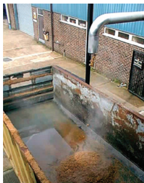
seepex BT range pump while conveying spent grain out of the mash tun into a tractor-trailer