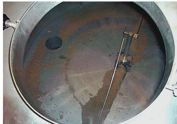
View inside mash tun