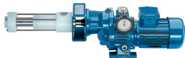
Typical seepex pump design for NaOCl feeding

After successfully switching to progressive cavity pumps for sodium hypochlorite pumping, Parola explored the possibility of using the pumps for metering a chloramine solution used at Zone 7's wells. Chloramination enhances water quality by reducing trihalomethanes and by stabilizing the NaOCl so its effect lasts longer. As ammonia can be a problem for metering equipment, Parola asked Misco if seepex could help.