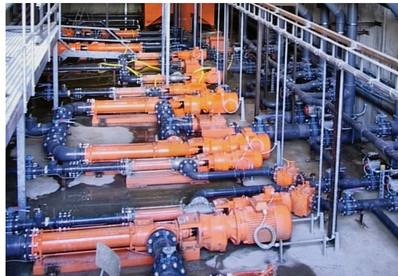
seepex pumps in the central fodder kitchen during the distribution of the fodder pulp from the mixing containers in various pipes

A renowned manufacturer of fodder systems initially tested a seepex progressive cavity pump, and it satisfied the customer's requirements with more than satisfactory results.